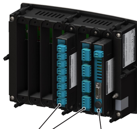
Up to 7 plug-in input and output interface modules Plug-in CPU module

Documentation and support are extensive including instruction manuals for the display, CODESYS software and each of the plug-in modules, plus videos and application guides. CODESYS runtime is a well known industry standard software package. Demonstration systems can be viewed at the BEKA sales office and at some BEKA agents. Loan systems are available for evaluation and programme development.